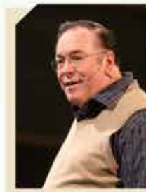
KENNETH W. HAGIN