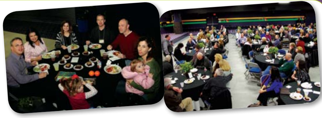
Grads from 1983, 1993, and 2003 celebrated their 30-, 20-, and 10-year reunions.