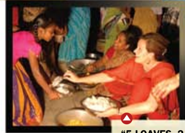
▶ "5 LOAVES, 2 FISH" AFTER-SCHOOL PROGRAM

Leprosy had not only taken some of her fingers, it had also left her blind. In His great love, God healed her and restored her sight!