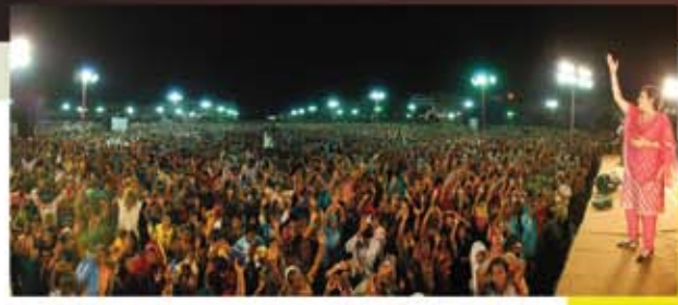
▶ OUTREACH IN INDIA