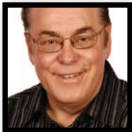
KENNETH W. HAGIN

In the middle of the big-league baseball season, players gather for the annual midsummer classic all-star game.