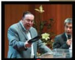
ONE OF FOUR SESSIONS IN A PACKED AUDITORIUM