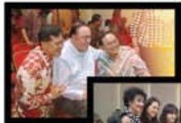
THE PEOPLE OF INDONESIA WERE EXCITED TO HEAR THE WORD AND MEET THE HAGINS.