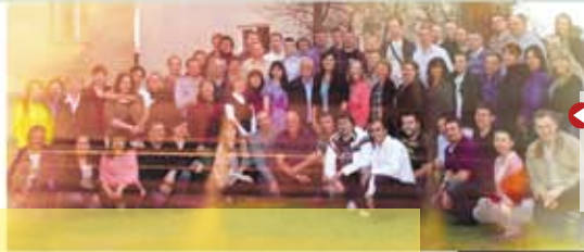
▶ ANNUAL EVANGELISTS' TRAINING CONFERENCE